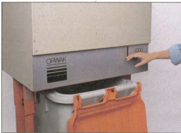
The hydraulic compactor is easy and safe to operate.

Boxes, cans and other refuse will be compacted to approx. 10% of its original volume.