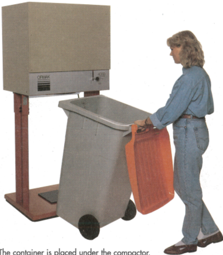
The container is placed under the compactor.

For efficient use of standard wheeled containers.